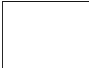
Figure No. : name..... (Center)